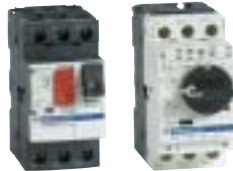
GV2 ME GV2 P